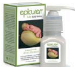
baby daily lotion