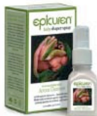
baby diaper spray