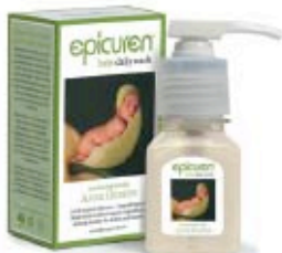
baby daily wash

These beautiful aromatherapeutic products are backed by 30 years of industry experience and a passion to give children the very best.