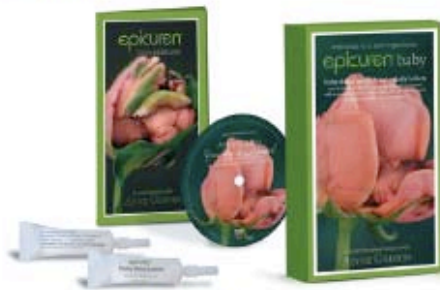
baby welcome set