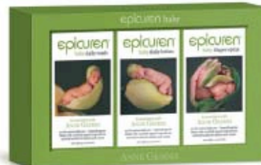
baby gift set

100% natural skincare • Made with certified organic ingredients • Actively healthy for babies and moms • Episcencial™ aromatherapy to support the bonding experience • Hypoallergenic